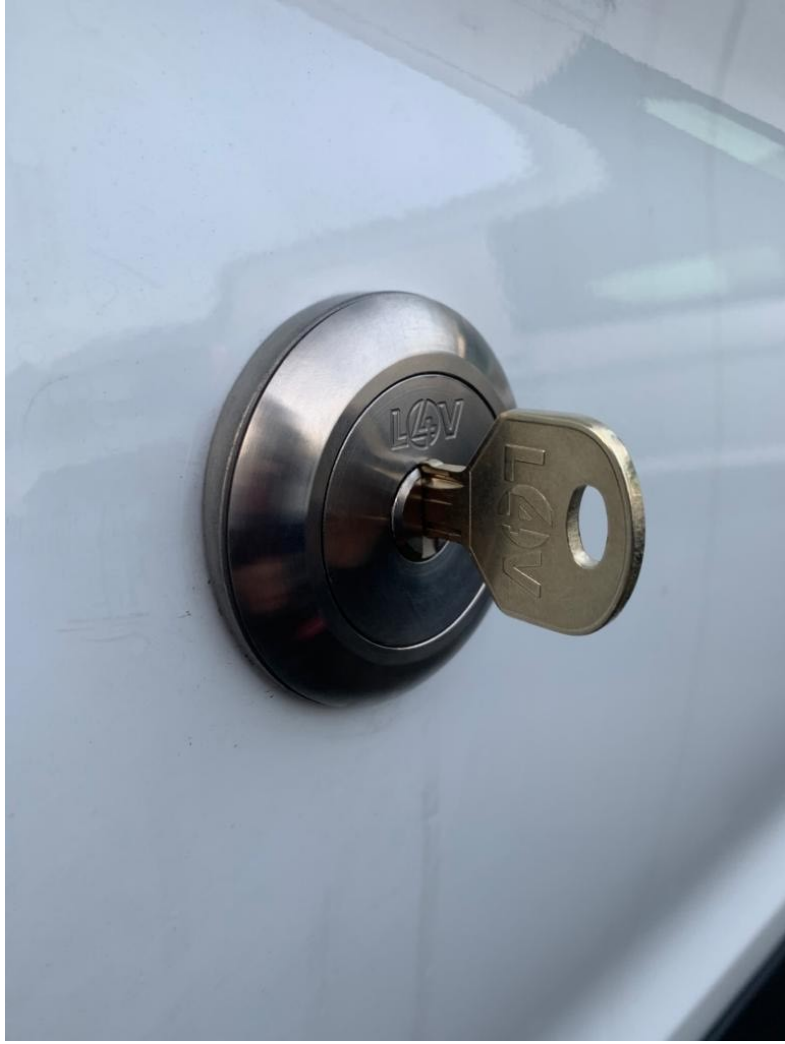
Ford Transit Custom Replacement Lock